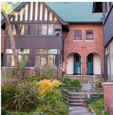
Bain Apartments Co-operative, Toronto

“As a new co-ordinator, I have been very happy with the support and guidance provided by the co-op’s relationship manager. She has always been available to answer questions and/or research the information needed to assist. I have found this to be a very valuable resource and support and very much appreciate the support provided.”